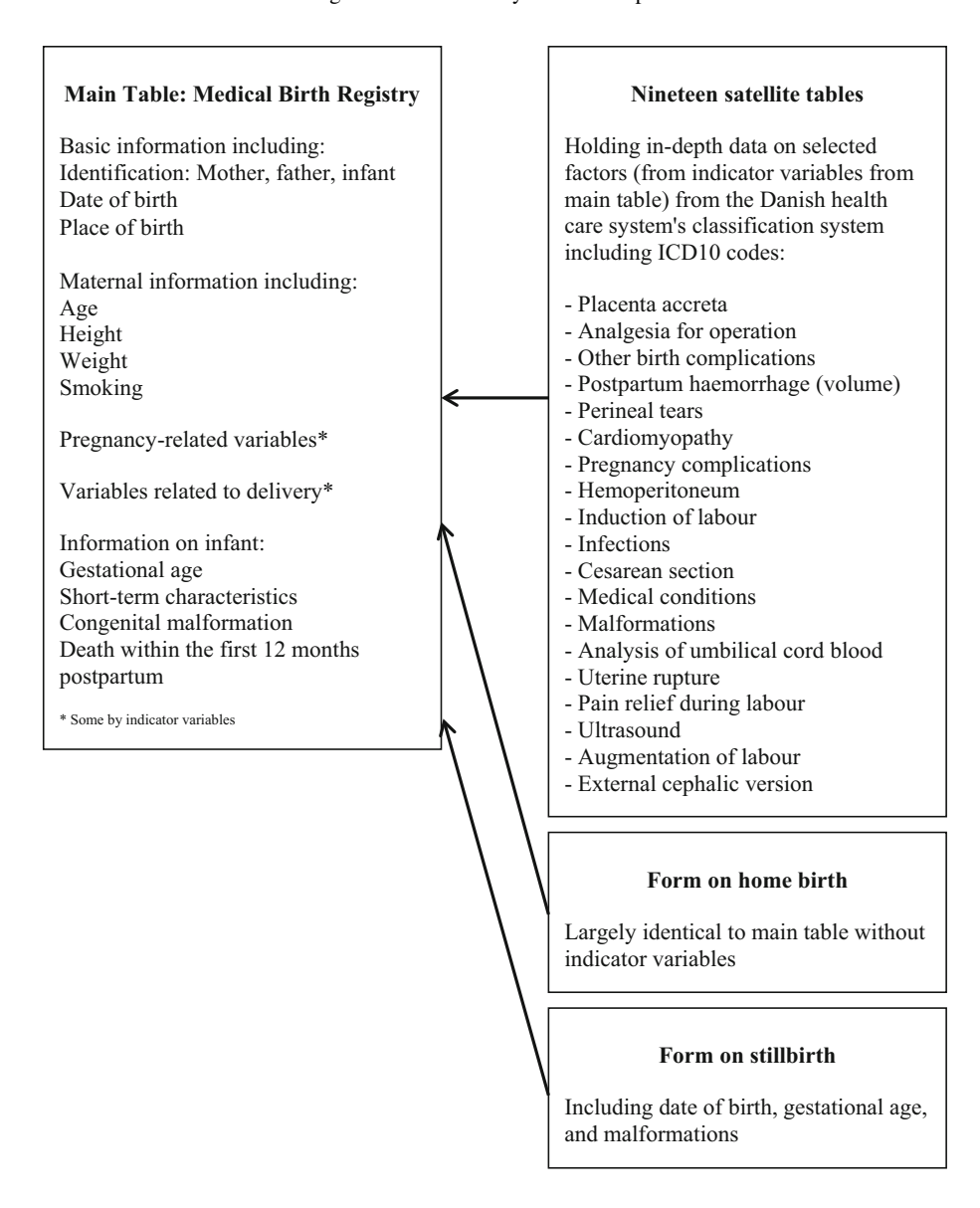
Fig. 2 Structure and main content of the Danish Medical Birth Register since 1997